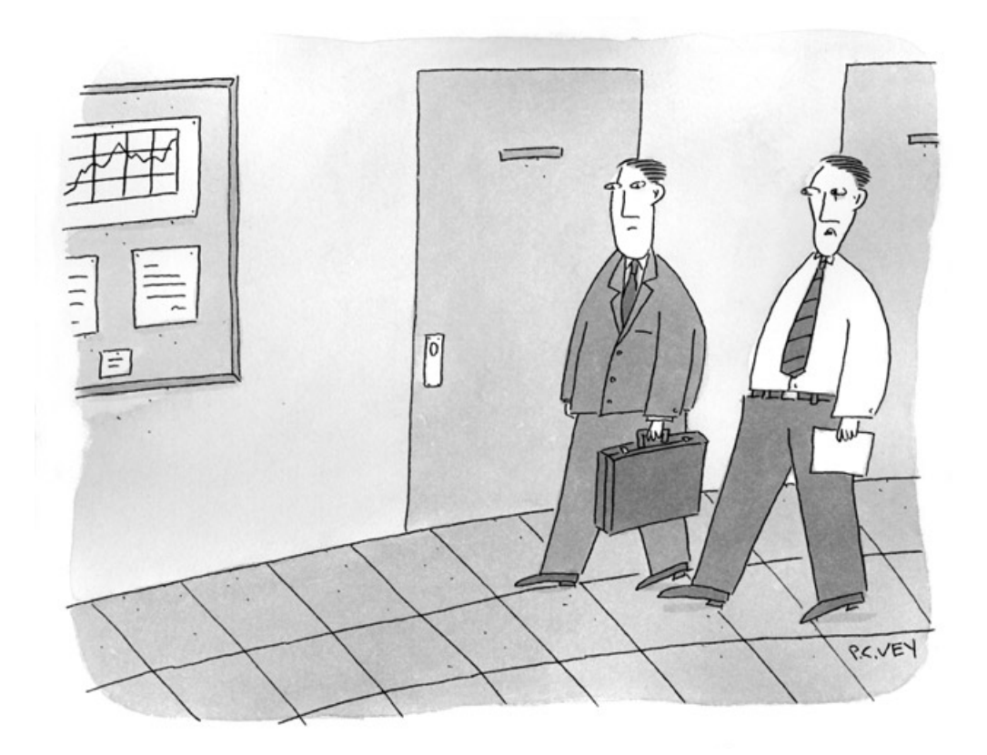
"What we need are some fresh new ideas. You know, like we had last year."

Reprint R0603F; HBR OnPoint 3544 To order, see page 151.