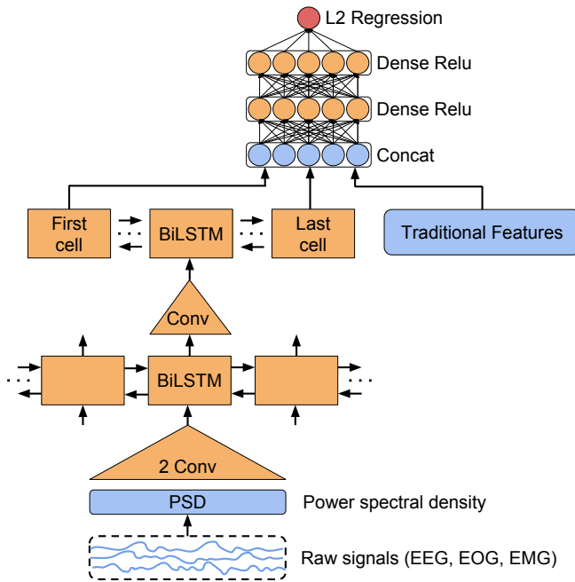
Figure 1. Neural network architecture that gave the best prediction.

storing knowledge gained while solving one problem and applying it to a different but related problem. If a variable x is very correlated with the variable y we want to predict, a model that first learns how to predict x can be trained to learn y very efficiently. Our idea was to ensure that the network learns features of the EEG data that is representative of the SSQ. We pre-trained the network to learn variables correlated with SSQ according to Kaplan et al. [2], before training it to learn to predict SSQ. It also allowed us to examine how well the network can predict simple variables from EEG signals and gain insight into how RNNs understand EEG structure.