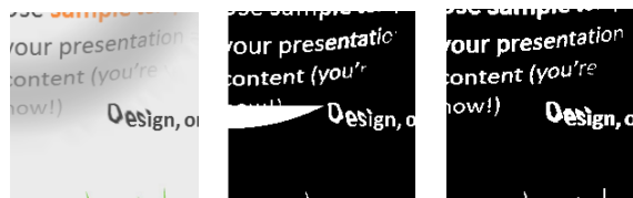
Fig. 1: The left, middle and right images denote the original image, segmented foreground by hierarchical k-means and the proposed algorithm respectively.

One problem with clustering-based segmentation techniques is that if the intensity of background pixels has a large dynamic range, some part of the background could be segmented as foreground. One such example is shown in Fig. 1, where the foreground mask (a binary mask showing the location of foreground pixels) for a sample image by hierarchical clustering and the proposed algorithm are shown.