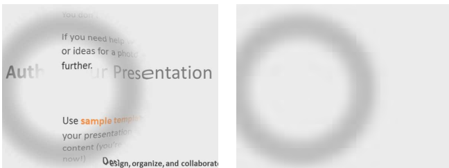
Fig. 3: The reconstructed background of an image

To illustrate the smoothness of the background layer and its suitability for being coded with transform-based coding, the filled background layer of a sample image is presented in Fig. 3. The background holes (pixels belonging to the foreground layer) are filled by the predicted value using the smooth model, which is obtained using the least squares fitting to the detected background pixels. As we can see, the background layer is very smooth and does not contain any text and graphics.